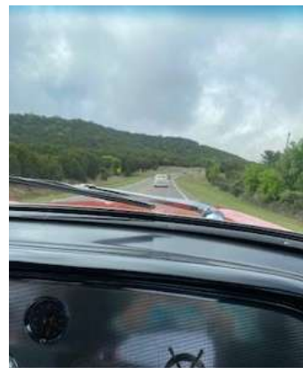
Lining up for Early Bird Tour