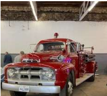
In Lampas at the Ford Museum