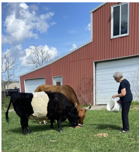
After the meeting – the cows were fed