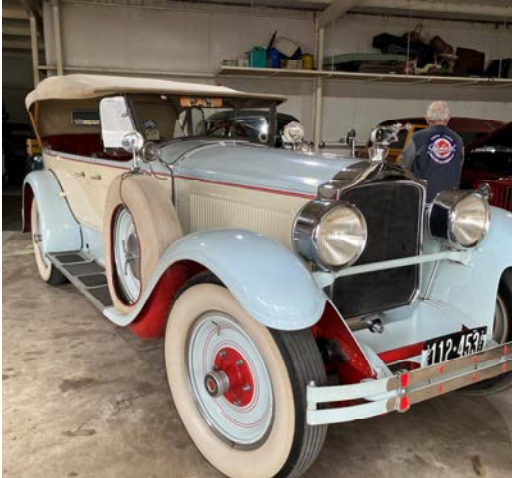
FDR's Personal 1927 Packard convertible