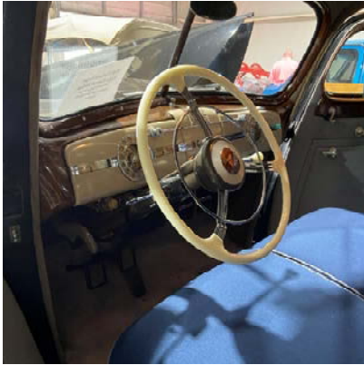
Inside 1940 Formal Sedan