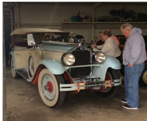
These guys are really checking out Alton’s 1927 Dual Windshield Packard