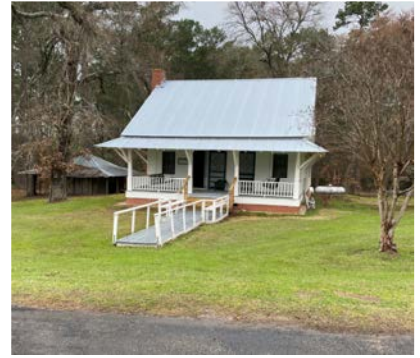
Alton's boyhood home