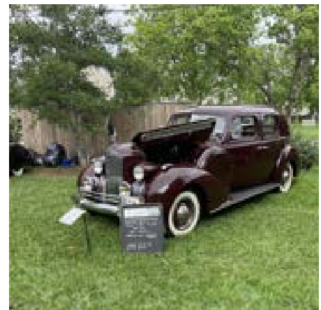
Baccaro's 1940 160 Club Sedan