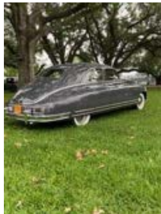
Stephen's 1949 Custom