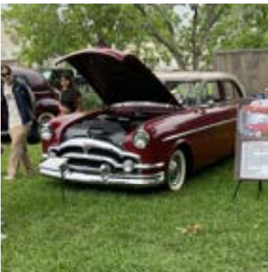
Baccaro's 1954 Cavalier front view