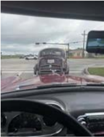
Driving to K&W