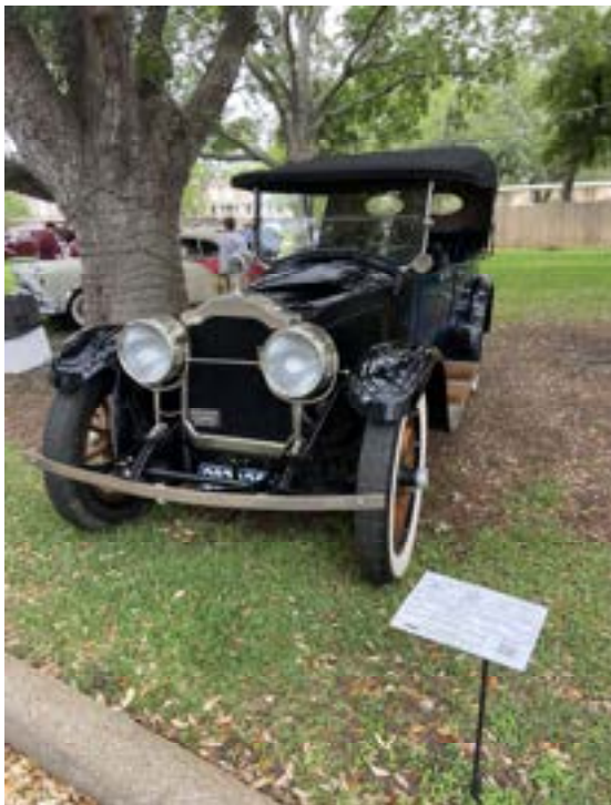
Evelyn’s 1920 Twin six Packard