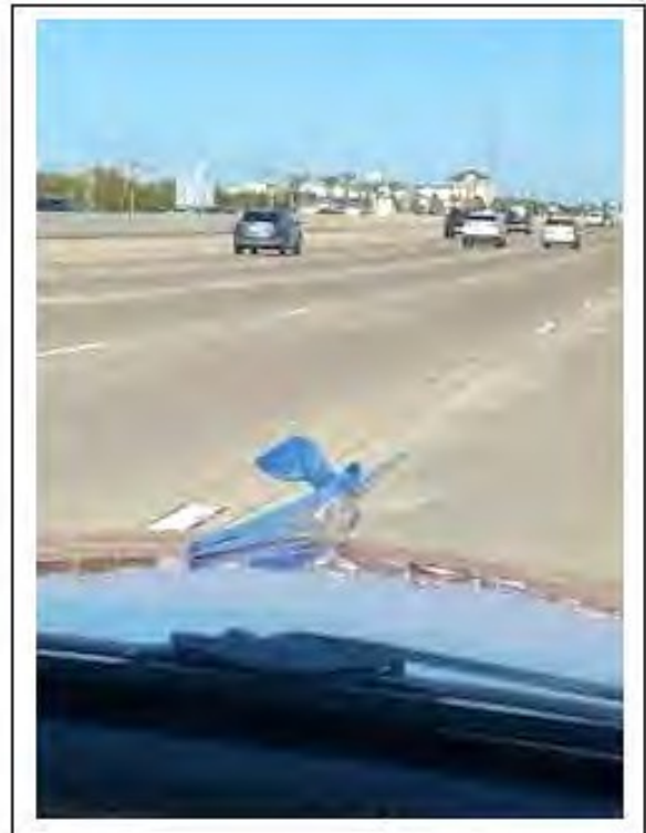
Tommy's view of the road as he looks over the Cormorant heading to Richmond.